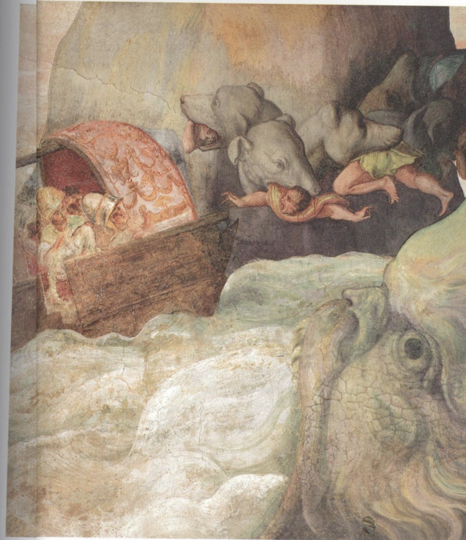
Scylla and Charybdis from the Ulysses Cycle (1580), Alessandro Allori. Fresco. Banca Toscana (Palazzo Salviati), Florence.

Apart from depicting a different narrative moment, how does this 16th-century painting differ from the one on page 1131? Be specific in describing the differences in style and mood.